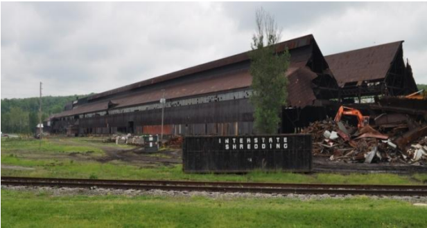
CASTLO Building "1"

As part of a Job Ready Sites grant from the State of Ohio, demolition of the 330,000 square foot former Youngstown Sheet and Tube spike mill is underway at the CASTLO Industrial Park.